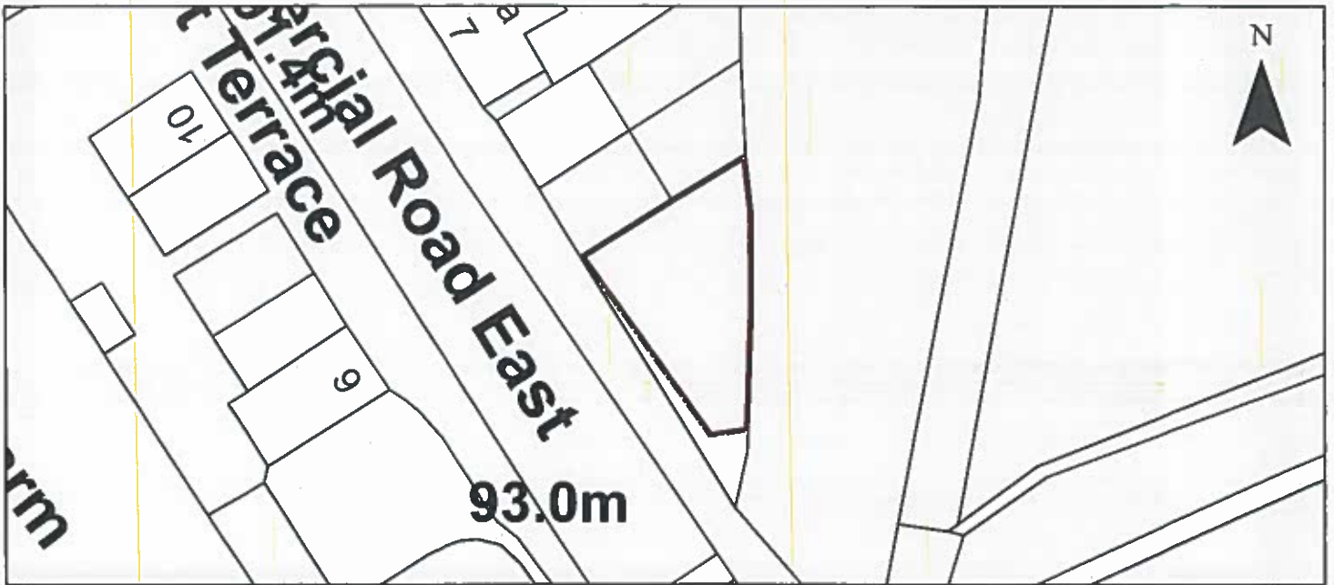
DETAILED VIEW NOT TO SCALE.